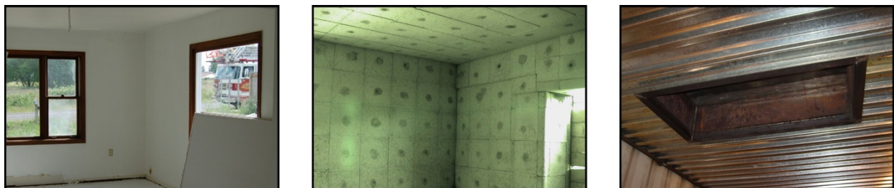
Figure 2. Variations in Structural Characteristics Influence Fire Behavior

Note: From left to right, these photos illustrate an acquired structure with gypsum board compartment linings, a purpose built masonry burn building with high temperature ceramic lining, and steel container based prop with corrugated sheet steel lining.